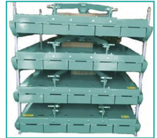
Način pakovanja The way of packaging