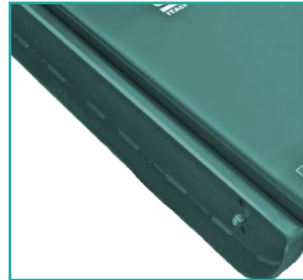
Klizači sa podešavanjem radne visine Sliders with adjustable working heights