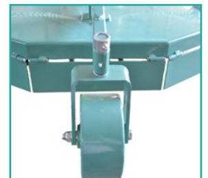
Zadnji točak Rear wheel